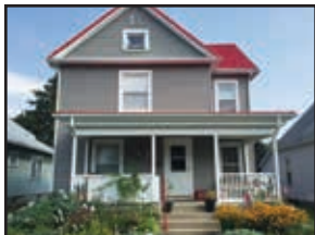
Leon & Betsy Waldsmith 808 Boone Street