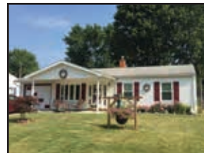
Dorothy M. Fitch 1534 Edge Street