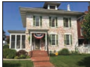
Lori Huebner 420 N. Downing Street