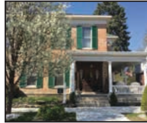
Susie & Wayne Pope 220 W. Greene Street