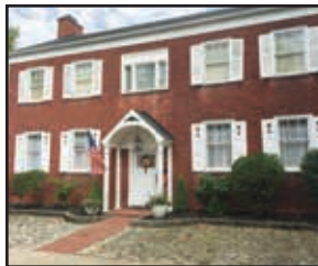
Greg & Mia Campbell 525 Caldwell Street