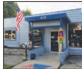
May's Lost Treasures 915 Clark Avenue

The Residence Pride Award is based on the following criteria: