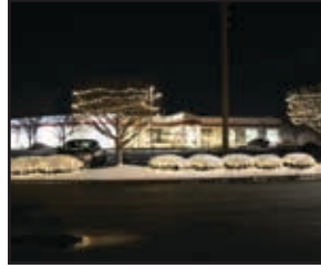
Hartzell Propeller Inc. 1 Propeller Way