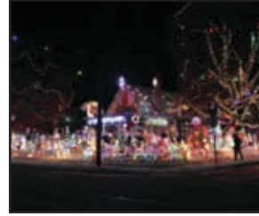
The Smith Family 1244 Broadway Street